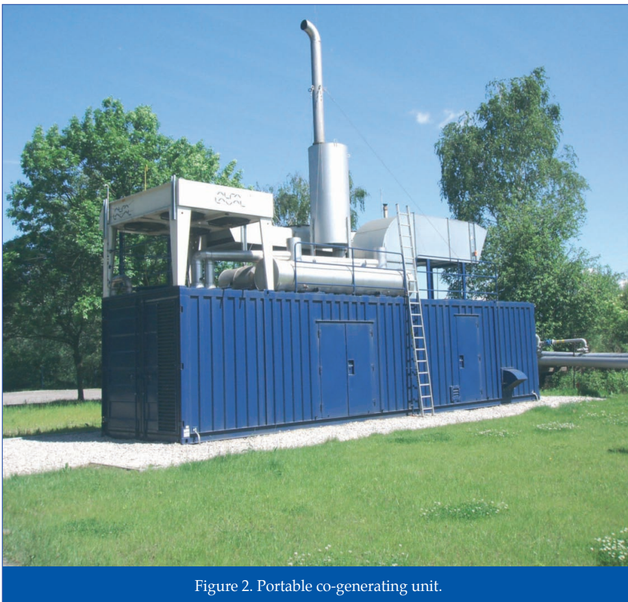
Figure 2. Portable co-generating unit.

DPB provides a wide scope of engineering services to the local mining industry. Presently, it is preparing and coordinating safety risk assessments for the future mining of 21 coalfaces in the OKR mines. The company provides services in mine ventilation, degassing, air conditioning of future coalfaces, geological and geo-technical work and hydrogeology safety measures. With a successful track record in these areas, the company's specialists work on these projects with domestic institutes such as